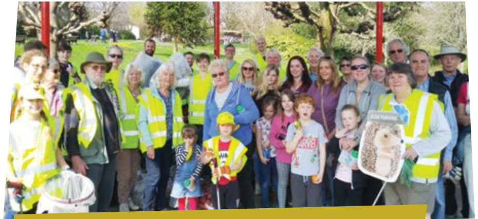
Dorchester Spring Clean event 30 th March organised by Litter Free Dorset

Currently the largest threats to West Dorset are firstly the 3500 houses north of Dorchester. We are working with