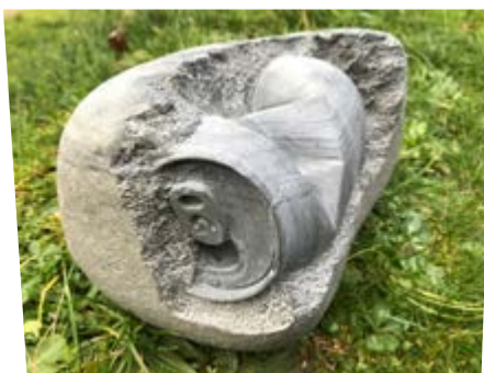
A Gift 4 Gove sculpture of 'future fossils'