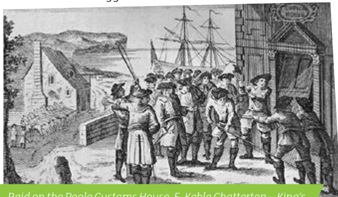
Raid on the Poole Customs House. E. Keble Chatterton – King's Cutters and Smugglers 1700–1855/Wikimedia Commons

Punitive taxation was primarily responsible for the explosion in smuggling. During the Civil War a new excise tax was levied to pay for it, and even after it ended it still covered chocolate, coffee, tea, beer, cider and spirits. However, after 1688 it was progressively broadened to include other essentials such as salt, leather, and soap. There were also customs duties to pay, which had a historical precedent in that the Crown had for centuries claimed a proportion of all cargoes entering the country. The wars with France were a drain on the Exchequer and tax rates increased further in the 18 th century, so that the combined rates on tea reached 70% of its import cost. This affected all classes but in particular it angered the rural population, many suffering from poverty. To complicate matters, the collection of customs duties was haphazard, bureaucratic and corrupt. Smugglers were basically opportunists, taking advantage of a demand for highly-taxed luxury goods and the government's almost total inability to collect those taxes. By the end of the 18 th century two thirds of all tea imported into the UK was believed to be smuggled!