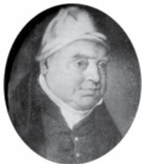
Isaac Gulliver, the most famous Dorset smuggler

The villages behind the Fleet developed a thriving commerce in spirits, tea, tobacco and lace. The community close to Chickerell is today the best-known, since it provided the basis for J Meade Falkner's novel Moonfleet. Though fictional, the story had its foundations in the trade that flourished here. Some of the places mentioned in the book can be seen locally and the tiny chapel is especially atmospheric: it was here that tubs bumped together in the flooded vault. It can be found at East Fleet overlooking the Fleet, as it only just survived the tidal wave that struck it in 1824. The headland called The Snout in the book is Portland Bill. Nearby Abbotsbury boasts a dramatic chapel too on the hill-top, which provides a fine navigational marker, and the local smuggling HQ was the Ilchester Arms, once the Ship Inn.