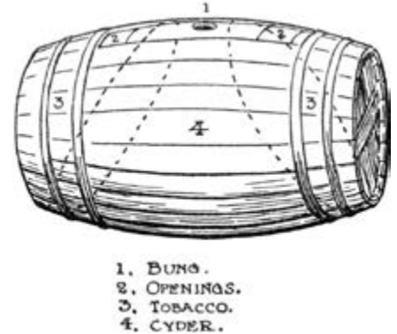
Cask adapted for smuggling

Otherwise the goods would be sold around the public bars, or gin houses. In the countryside distribution of spirits was sometimes carried out by hiding a pig's bladder full of spirits under a woman's clothing — pregnancy explained away a large swelling. If captured, a quick stab with a knife was all that was needed to get rid of it.