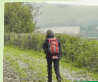
Walking on Public Right of Way near Cerne Abbas

these “lost paths” may be. The Ramblers Association provide an online guide to help you get started on the hunt for lost rights of way in your area. Please visit https://www.ramblers.org.uk/get-involved/campaign-with-us/dont-lose-your-way.aspx or email DLYW@ramblers.org.uk for more information.