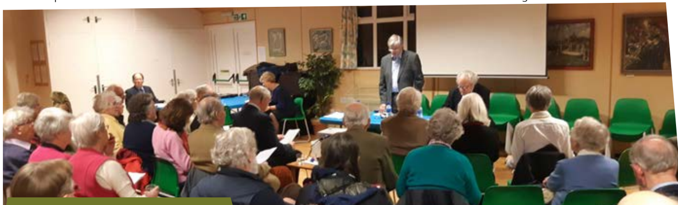
Sherborne and District Society AGM