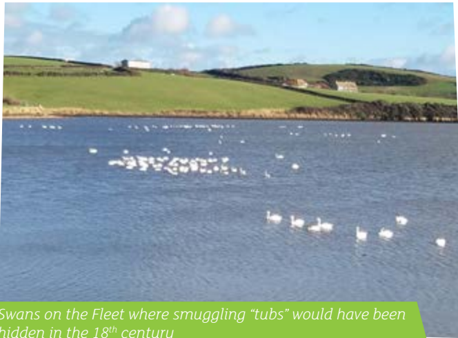
Swans on the Fleet where smuggling "tubs" would have been hidden in the 18 th century

I remember as a boy reading avidly J.Meade Falkner's Moonfleet , that vivid tale of smuggling, treasure and shipwreck set around Chesil beach in Dorset in the 18 th century. Every year TV dramas, such as Poldark , continue to remind us of the derring-do of smugglers from that period. Beyond the fiction, however, you do not have to dig that deep to find out about the surprising scale, motivation and real-life characters behind the explosion of illegal trade in the 18 th century, carried out all over England's southern coast, and in particular Dorset.