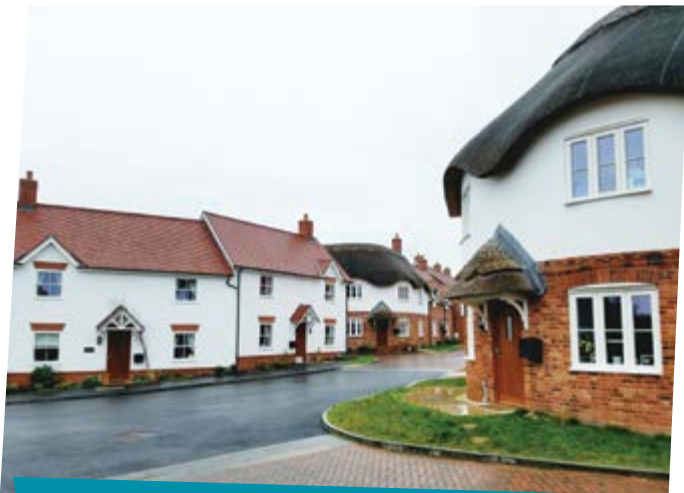
Attractive vernacular estate at Old Dairy, Okeford Fitzpaine

However, Wyatt Homes, CG Fry, Morrish and Parsons & Joyce are good examples of smaller builders still active in Dorset that have received praise for some, and sometimes a lot, of their work. Estates that appear well designed and vernacular in style include Old Dairy on the old Faccenda chicken factory site at Okeford Fitzpaine (Parsons & Joyce), Augustan Avenue in Shillingstone (Wyatt Homes), Manor Farm Close in Pimperne (Wyatt Homes) and Malt House Meadows in Portesham (CG Fry). This does not mean we are against modern or contemporary, but such housing mostly looks better in an urban environment. By contrast take most Persimmon estates and there is a dull uniformity in the serried rows of “Noddy box” style houses they construct, which usually pay no attention to local vernacular, and offer little diversity. Many of the other national house builders are equally guilty. We would like to see estates that will gradually blend into their surroundings, not stand out like sore thumbs.