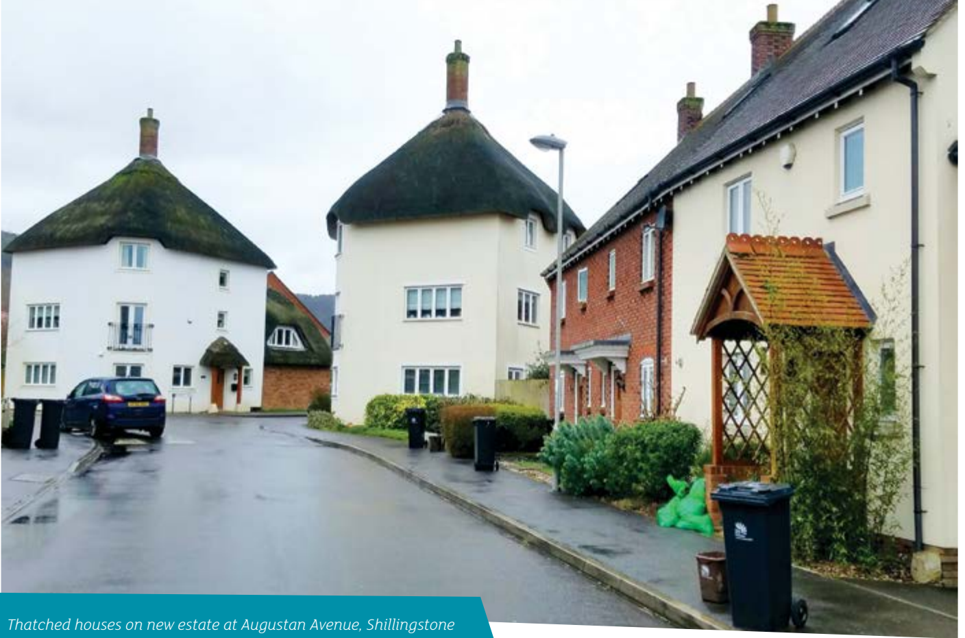
Thatched houses on new estate at Augustan Avenue, Shillingstone

Before the 17 th Century all domestic architecture was generally vernacular, whether it be a hall house or hovel, farmhouse or cottage. Houses were built with what was available in terms of local materials, and they were usually simple, practical and rugged. These houses were the building blocks of rural villages and are distinct from grander “polite” ones which are characterised by stylistic elements of design for aesthetic purposes which go beyond a building’s functional requirements, probably using local materials, but not always, in any part of the country. Examples might be Jacobean, Georgian or Victorian Gothic which are reminiscent of different styles and ages.