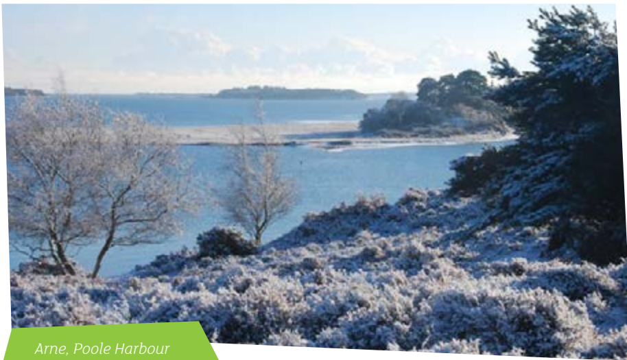
Arne, Poole Harbour

1: The absence of any mention in the consultation documents of the role of The Maritime Management Organisation (MMO) was surprising