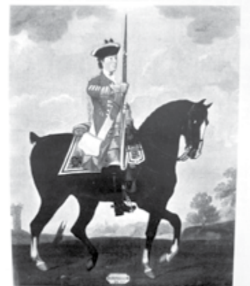
A dragoon in the 6th Dragoons as he would have looked in 1779. These Dragoons all rode black horses until 1796 when the authorities decided that it was no longer possible to get a black horse for all the country.

PS I am indebted to Richard Platt who wrote an excellent book Smuggling in the British Isles as I borrowed some incidents and text from it. Please buy it if interested to know more!