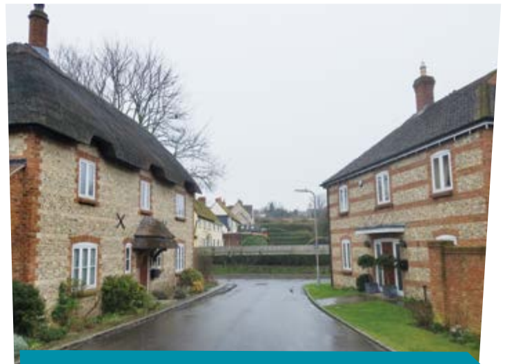
Handsome brick and flint houses at Manor Farm Close, Pimperne

We do not expect modern housing estates to fully emulate historic vernacular buildings, but to blend into existing villages built up over centuries they need to pay more than nominal lip service. The National Planning Policy Framework says that “planning policies and decisions should ensure that developments....are visually attractive as a result of good architecture are sympathetic to local character and history, including the surrounding built environment and history”. Some builders do try quite hard to do vernacular