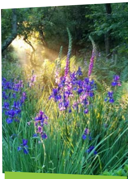
Sunset casts its magic over irises and foxgloves