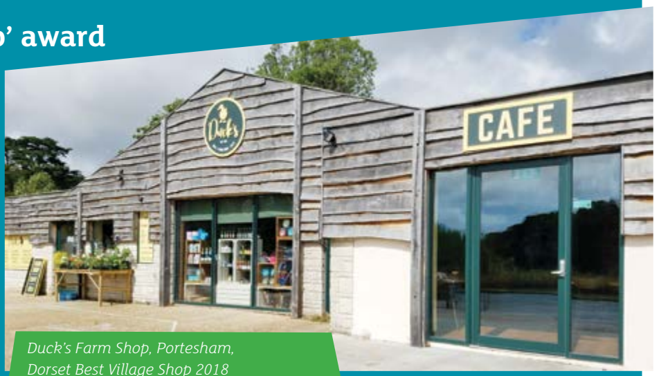
Duck's Farm Shop, Portesham, Dorset Best Village Shop 2018

Dorset CPRE is sponsoring for the sixth year the 'Best Village Shop' category in this year's Magna Housing Best Village Competition. Duck's Farm Shop, Portesham, won Best Dorset Village Shop 2018, but Chapel Lane Stores, Abbotsbury, came in as a worthy runner-up. Communities are asked to nominate the village shop which serves them best, closing date is Monday 24th June 2019. Application forms are available from http://www.magna.org.uk/my-community/dorset-best-village-2019/ .