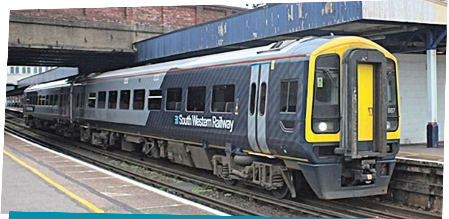
Class 158 set in First Group South Western Railway livery at Southamptton Central South Western Railway's diesel unit 158887 leaves Southamptton Central station with a service from Romsey to Salisbury

There are three rail lines now in Dorset and all three have seen a huge growth in passenger numbers over the last 20 years – since privatisation. These are: