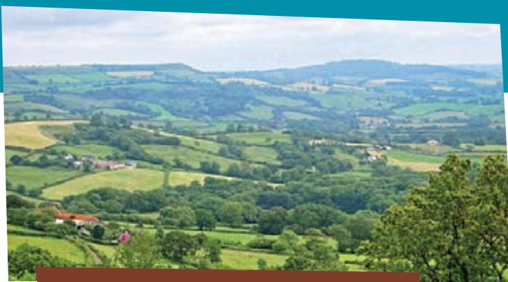
Pilsdon Pen, Lewesdon Hill, West Dorset

A NP would work with the Dorset Council, communities, farmers and landowners, to promote appropriate development, including housing for local people and truly affordable homes, and relevant economic development that rural Dorset needs. It could work with farmers and landowners to develop and deliver to all of rural Dorset locally relevant public benefit funding, as proposed by the South Downs and other NPs. A NP could develop a coherent tourism strategy, promote added value eco and heritage tourism, help spread the season and economic benefits to parts of Dorset that are underappreciated and help manage tourism pressures, e.g. at coastal hot-spots. It would work with all stakeholders to develop the natural capital investment strategy called for by the Dorset LNP.