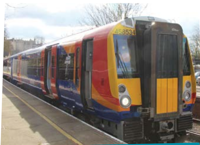
Class 458 set in Stagecoach South West Trains livery

The general view is that privatisation, which occurred generally between 1993 and 1996, has been hugely successful and in some respects it has been, although recently there have been growing calls for renationalisation. Passenger numbers have trebled, freight has held up despite a huge decline in heavy industry and investment has trebled with all new trains being funded privately though specialist leasing companies. So why do I qualify my praise? Infrastructure management and development, undertaken by state-owned Network Rail (NR) has been poor with investment unit costs rising fourfold over those of BR in constant prices. This has occurred, I believe, because so much technical expertise was lost in privatisation and fragmentation. 20 years on Network Rail still lacks an effective asset-register, showing the location, design and condition of track and other infrastructure assets. It is a shell-company with fat-cat directors, little expertise and is 'milked' by private sector contractors.