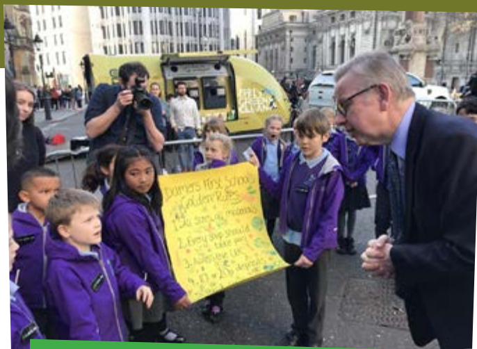
Children from Damers First School meet with Michael Gove

Borough Council (this will continue under the new Bournemouth, Christchurch and Poole Council) who provide equipment, and Bournemouth University who have allowed them to kit out the junior Devils and increase their reach with the TeamDD activities.