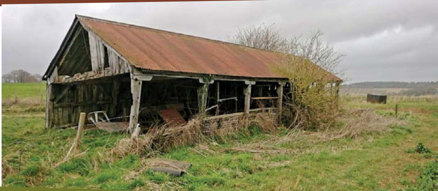
Derelict Barn featured in our publicity campaign on current threat to farms

In the current political climate it is tempting to think that not only hares are reckoned to be “mad” in March. Recent pronouncements by the US ambassador about the state of farming in the EU (and by implication the UK), the threat of a no-deal Brexit, and the contradictory remarks about US food exports made by Michael Gove MP and Liam Fox MP have all combined to cause enormous concern to the UK farming community.