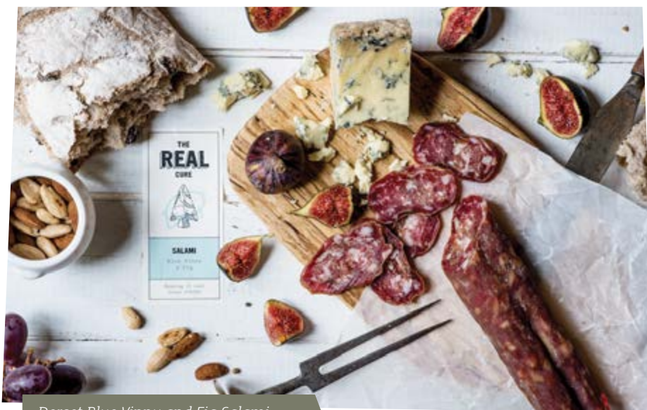
Dorset Blue Vinny and Fig Salami