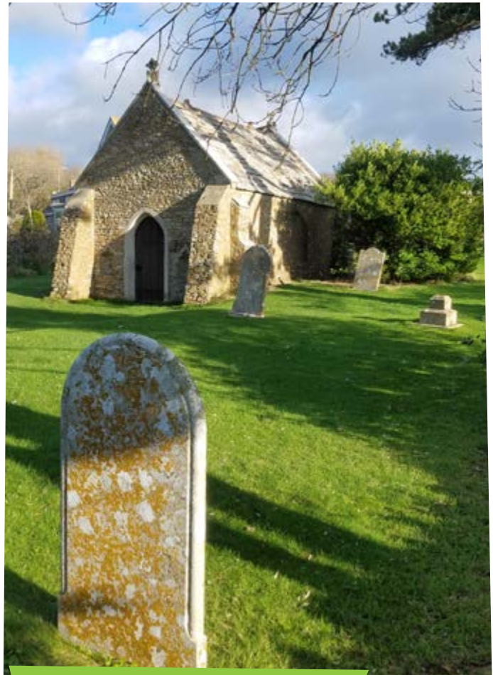
The "Moonfleet" Chapel at East Fleet