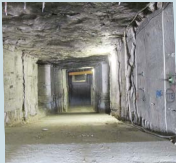
The Portland stone mine on the Isle of Portland

This will be almost another world underground with displays concentrating on biodiversity and how this has related to extinction and regeneration processes throughout the ages. The Project is headed by Dr Tim Smit and is supported by Dorset LEP (Local Enterprise Partnership), and by the new Dorset Council.