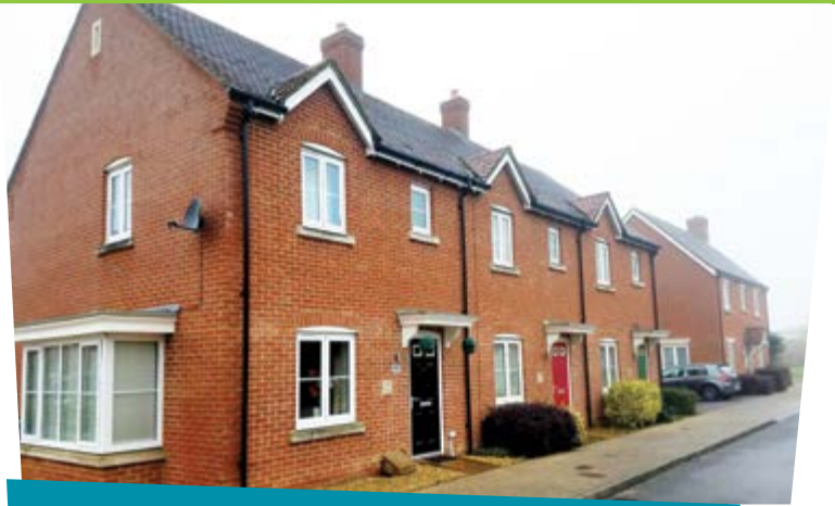
Dull Uniformity of Persimmon estate at Gurkha Road, Blandford

Why is this? There are clearly multiple factors at work but recent discussions with local builders suggest the following. Vernacular building clearly requires more skilled labour and is a little more expensive, and you can see this in the form of thatched roofs, or brick and flint fascias. Local builders mostly like working within the parameters of Local Plans, developing long-term relationships with those farmers and large estates who are concerned about their legacy to communities, and are better geared to delivering small estates, say under a hundred dwellings.